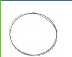
Stainless steel helical reinforcing bar