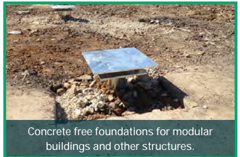
Concrete free foundations for modular buildings and other structures.