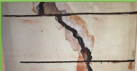
Structural repair of cracked brick, block or stone masonry.