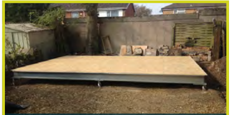
The finished deck provides a clean, level surface on which to build.