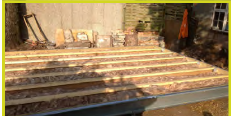
Insulation within the floor gives excellent thermal performance.