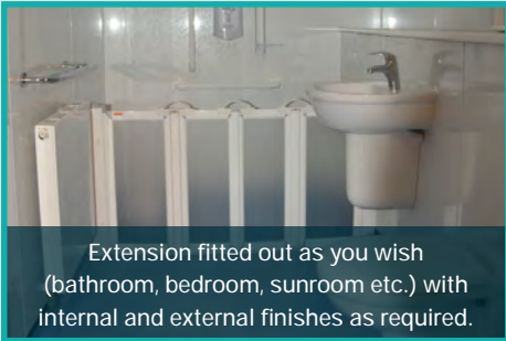
Extension fitted out as you wish (bathroom, bedroom, sunroom etc.) with internal and external finishes as required.