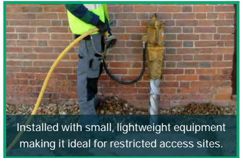
Installed with small, lightweight equipment making it ideal for restricted access sites.