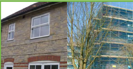
Small or large, domestic or commercial properties.