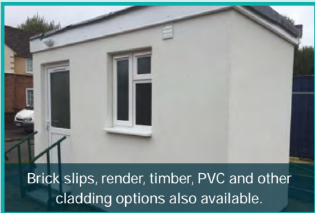
Brick slips, render, timber, PVC and other cladding options also available.