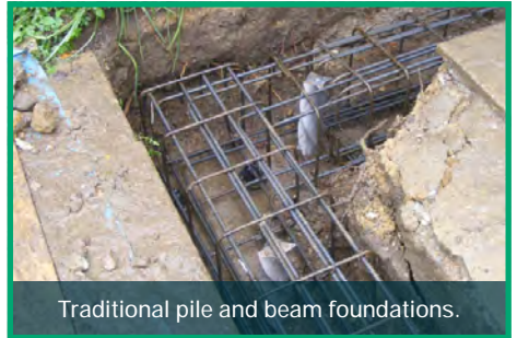
Traditional pile and beam foundations.